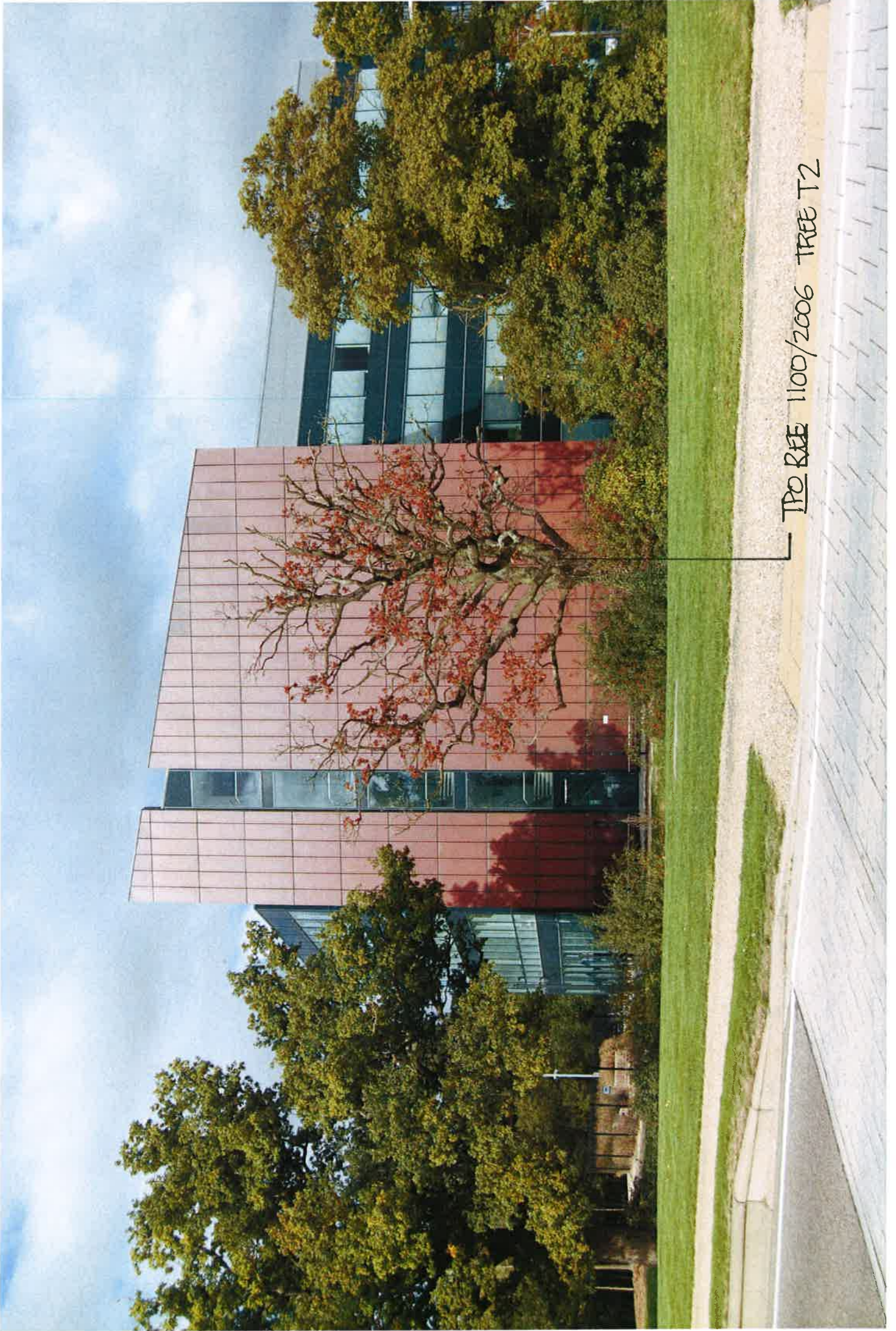
— PRO BEE 1100/2006 TREE T2